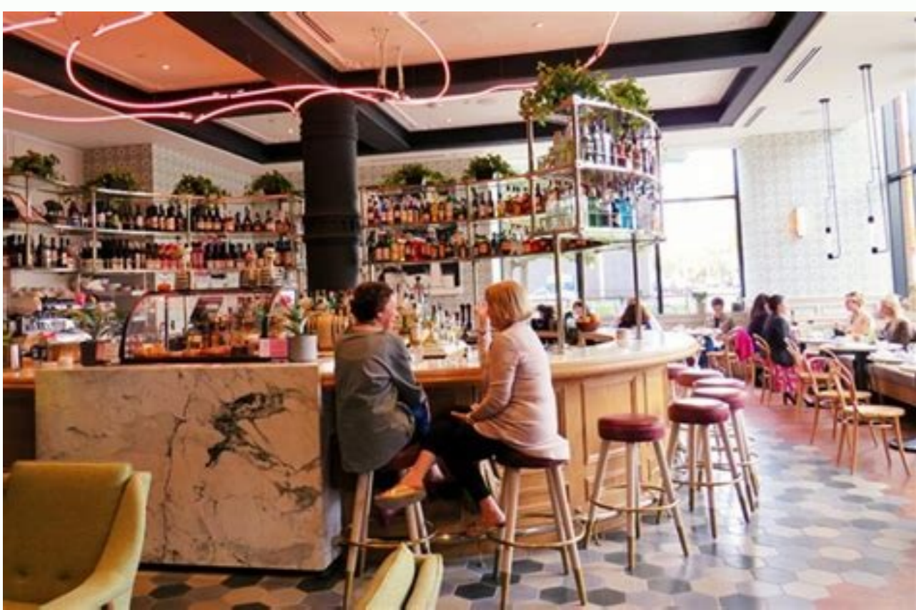
Broadsheet sydney best new restaurants. Broadsheet sydney. Broadsheet sydney new restaurants.